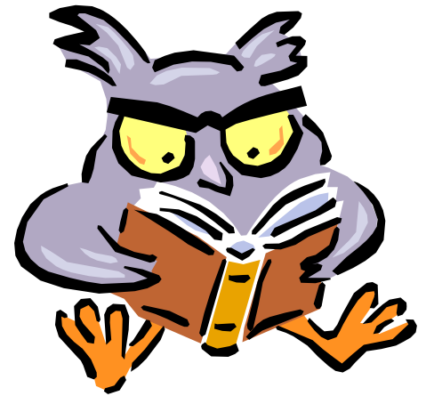
Look out for our Glapton O.W.Ls

Good luck to all our O.W.L s, we hope all goes well!